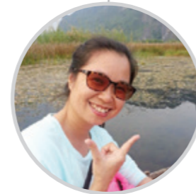
BAC Finance Manager